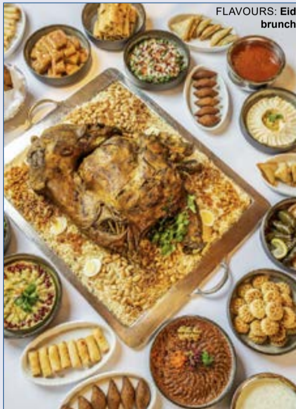
FLAVOURS: Eid brunch

A take-away option is also available. Guests can