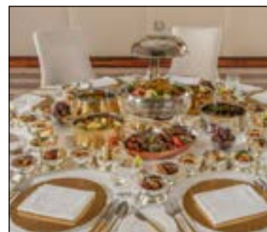
VARIETY: Delicious dishes for a premium experience

The Bahraini corner includes traditional dishes such as harees, thareed and madrouba, offering a sumptuous evening, while the grill station will serve up succulent kebabs.