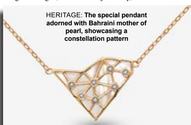
HERITAGE: The special pendant adorned with Bahraini mother of pearl, showcasing a constellation pattern