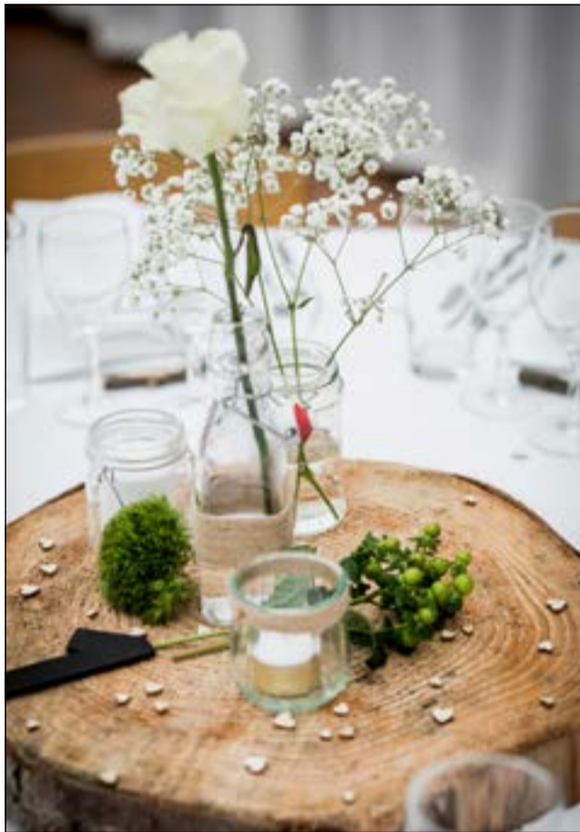
SUSTAINABLE: Repurposed glass jars used as vases

According to architects and managing partners at Duo Design Studio, Blossom Babu and Samantha Menezes, traditional lanterns crafted from natural materials like clay, wood, or glass, featuring intricate CNC