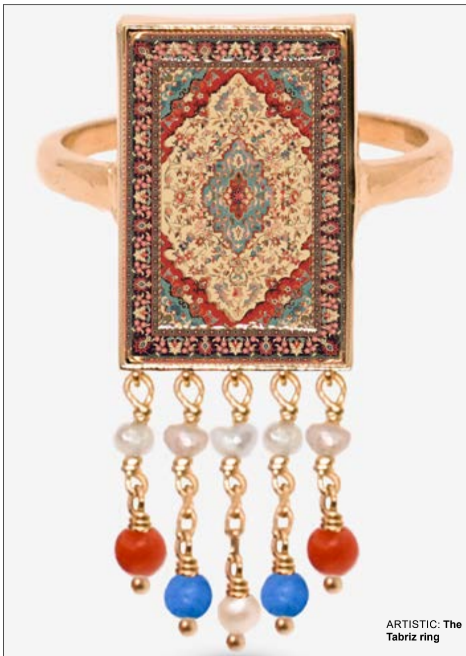
ARTISTIC: The Tabriz ring

"I don't want anything to go to waste, so I make it a point to reuse broken diamonds, many of which are of great quality. Creating jewellery made from recycled gold, as well as recut or repurposed gems is almost guaranteed to have a lower environmental impact than brand-new jewellery, and that's a win in