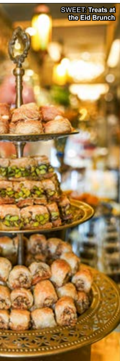
SWEET: Treats at the Eid Brunch

For more information, contact reception @ britishclubbahrain.com or call 17728245.