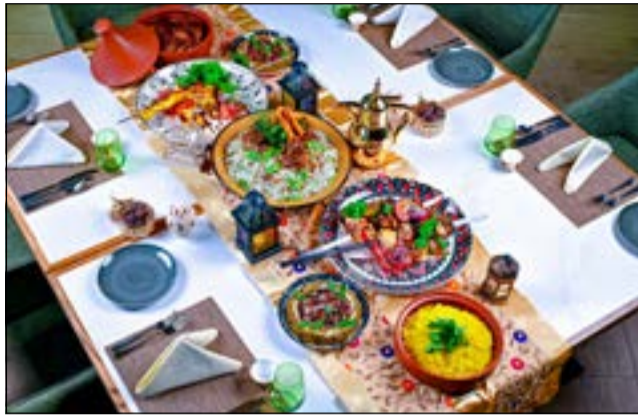
SPOILT FOR CHOICE: Tasty picks from the breakfast buffet