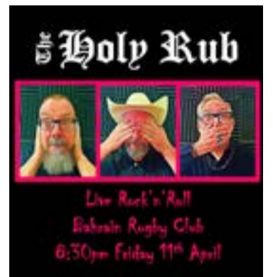
MUSICAL: A poster of the gig