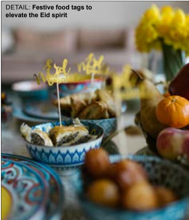
DETAIL: Festive food tags to elevate the Eid spirit