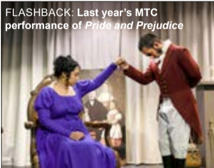
FLASHBACK: Last year's MTC performance of Pride and Prejudice

"However, the multi-ethnicity of the current cast compared to the original one will undoubtedly modernise the play's statement and touch on its universality.