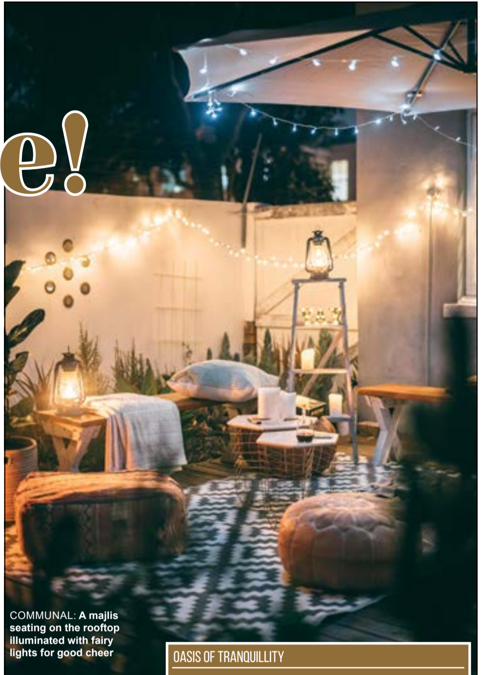
COMMUNAL: A majlis seating on the rooftop illuminated with fairy lights for good cheer

You can easily breathe new life into household staples like jars and old decorations