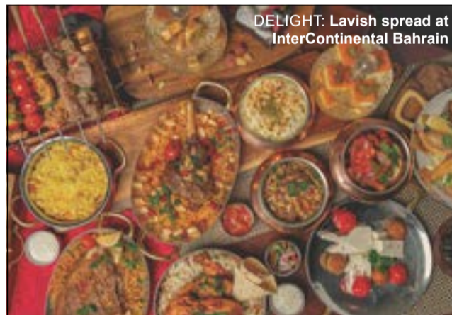
DELIGHT: Lavish spread at InterContinental Bahrain

Relax with loved ones at Noor Lounge every