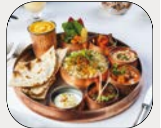
FEAST: Eid Royal Thali

Nirvana invites guests to embark on a culinary journey through the vibrant tastes