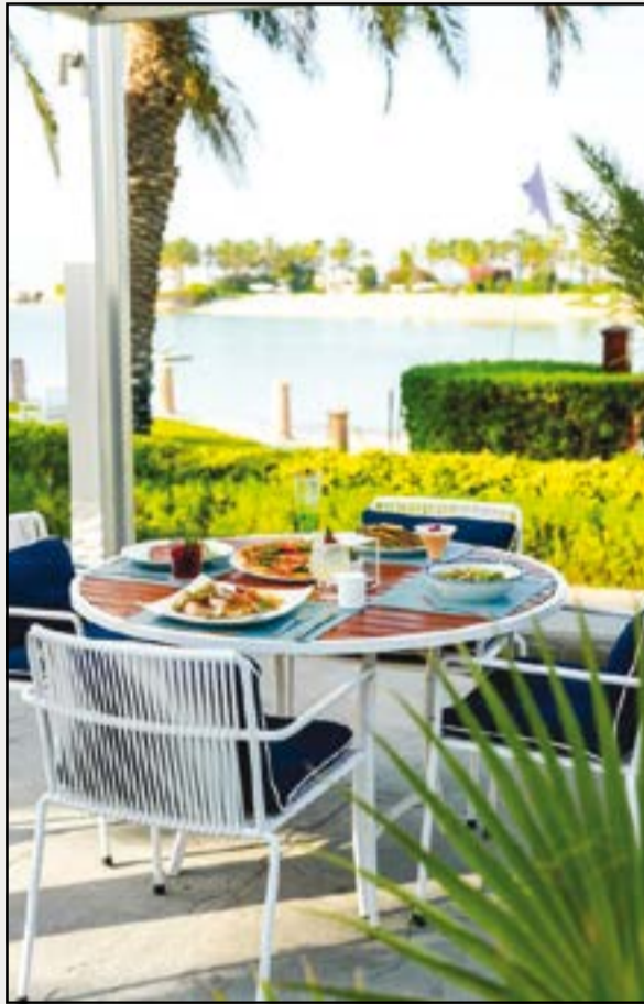
SERENE: La Plage's Al Fresco Eid Brunch

H EAD down to the Ritz-Carlton Bahrain for a spectacular culinary adventure for Eid Al Fitr.