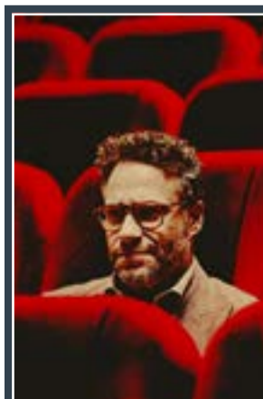
PULSE OF POP Movies, music & more SEE PAGE 6