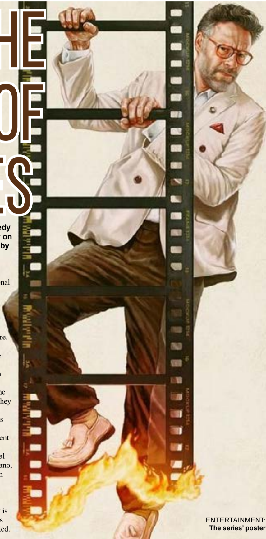
ENTERTAINMENT: The series' poster