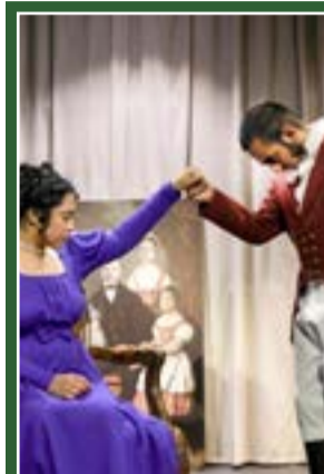
THE ODD COUPLE MTC back in action SEE PAGE 2

“Creating jewellery made from recycled gold, as well as recut or repurposed gems is almost guaranteed to have a lower environmental impact than brand-new jewellery”