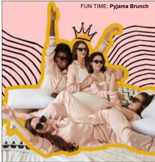
FUN TIME: Pyjama Brunch