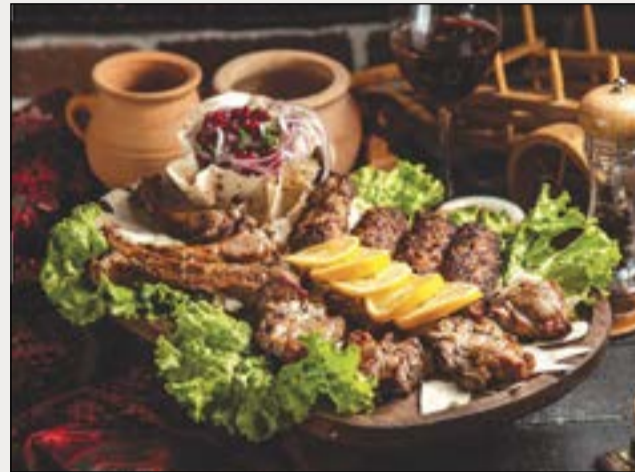
PERFECTLY COOKED: Meat at La Plage's Eid Arabian Barbecue Nights

Delight in British classics alongside global flavours, making this Eid a truly unforgettable celebration of family, togetherness and exceptional dining.