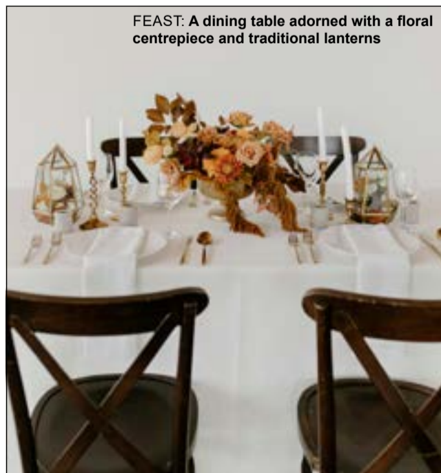
FEAST: A dining table adorned with a floral centrepiece and traditional lanterns