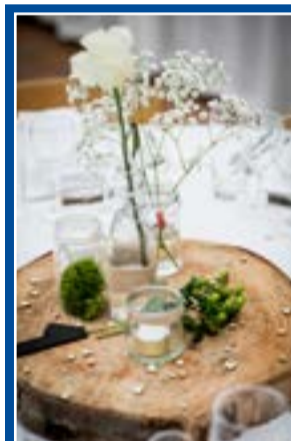
EID SPECIAL Festive home décor SEE PAGE 3