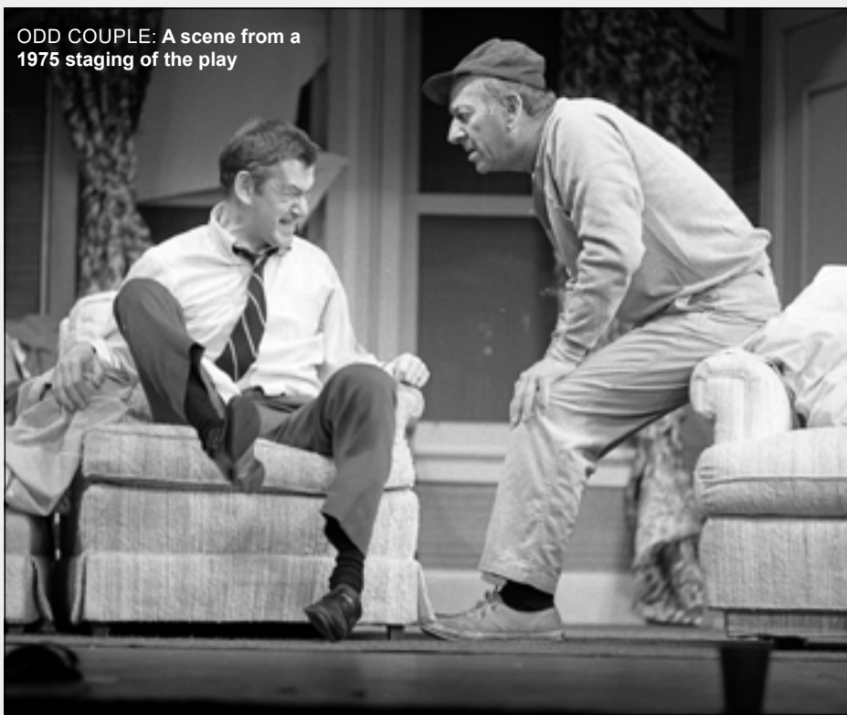
ODD COUPLE: A scene from a 1975 staging of the play