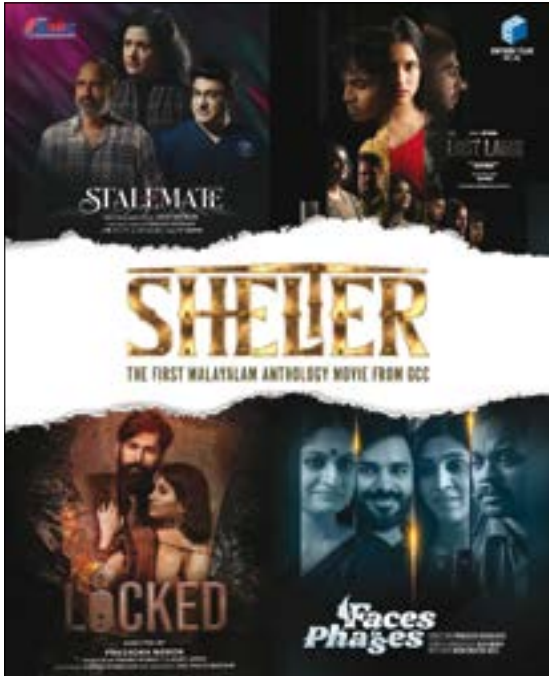
UNVEILED: The film poster