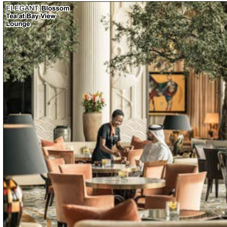
ELEGANT: Blossom Tea at Bay View Lounge