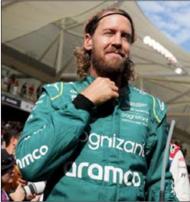
READY: Aston Martin’s Vettel ahead of his race in Abu Dhabi last year

“I think it’s a positive development because we are normal people,” the German,