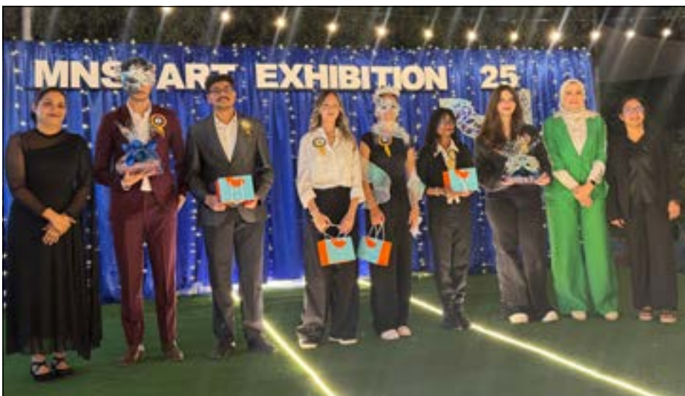
ACCOLADE: The Makeover Challenge winners on stage with the school principal

Call 17711444 or visit www.mns-bahrain.com for further information.