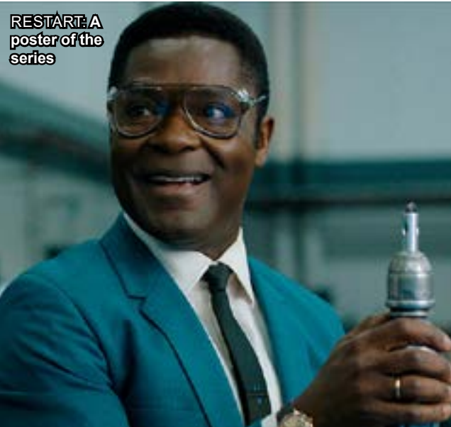
RESTART: A poster of the series

"I think all of us can understand and relate to the idea of wanting to be better, but constantly failing at doing that," he said.