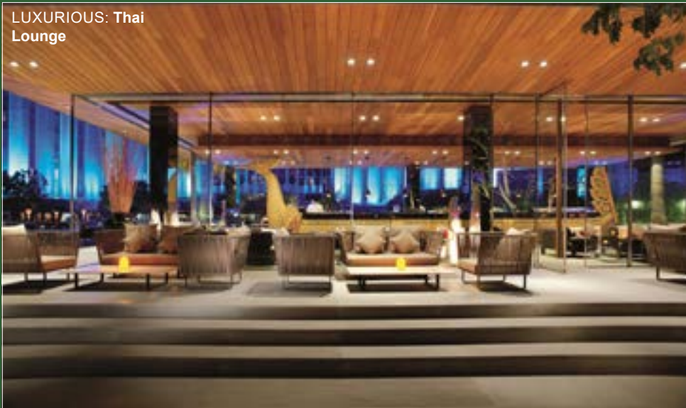
LUXURIOUS: Thai Lounge

menu. The dining affair will be complimented by lively rhythms of the Mariachi band.