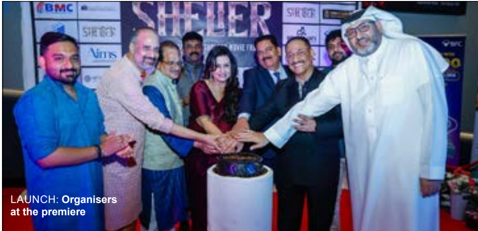
LAUNCH: Organisers at the premiere

"There's a lot of technicality involved and the editing phase is crucial. I spent a great deal of time on background work with three months just for shot division, so it was challenging but we're very happy with how it has turned out,"