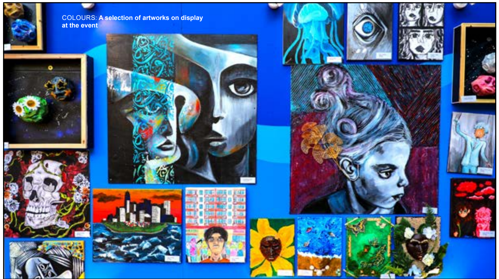
COLOURS: A selection of artworks on display at the event