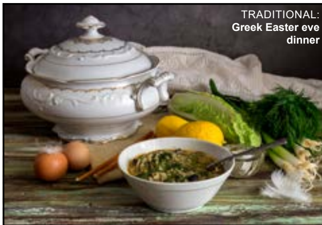
TRADITIONAL: Greek Easter eve dinner

● Make Easter memorable with Rigani-Regency Tent's Easter Brunch, blending Orthodox and Catholic traditions in a vibrant and