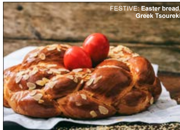
FESTIVE: Easter bread, Greek Tsoureki