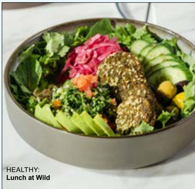
HEALTHY: Lunch at Wild