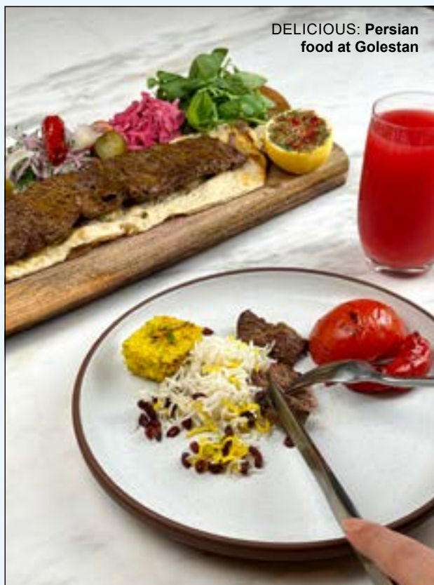
DELICIOUS: Persian food at Golestan

For more information contact 17533533 or 38885409 on WhatsApp.