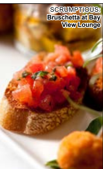
SCRUMPTIOUS: Bruschetta at Bay View Lounge