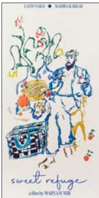
SWEET BONDS: Film poster

SHELTER ON SCREEN New movie anthology SEE PAGE 6