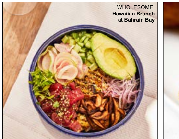
WHOLESOME: Hawaiian Brunch at Bahrain Bay